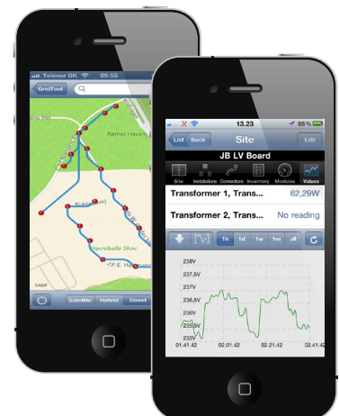
GridTool™ - The ultimate field tool for GridLight™