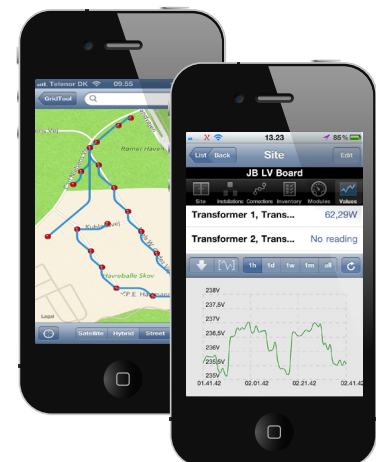
GridTool™ - The ultimate field tool for GridLight™